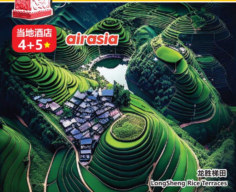
龙胜梯田 LongSheng Rice Terraces