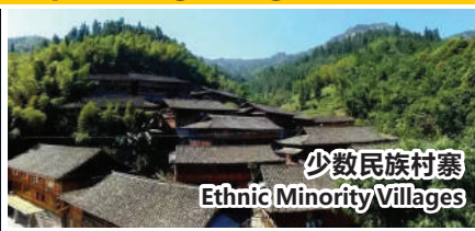
少数民族村寨 Ethnic Minority Villages