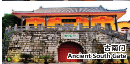
古南门 Ancient South Gate

1 nights stay **5 star Hotel **Lijiang Waterfall Hotel** Nine Heavens Milky Way, the Large in Man-made Waterfall, and it has been in the Guinness World Records.