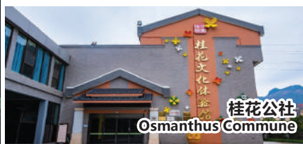
桂花公社 Osmanthus Commune