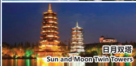
日月双塔 Sun and Moon Twin Towers