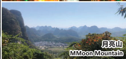
月亮山 Moon Mountain