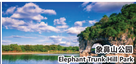
象鼻山公园 Elephant Trunk Hill Park